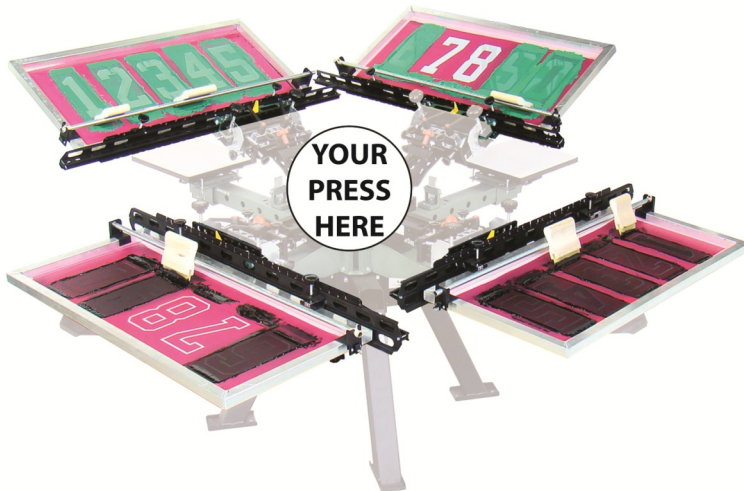
Shown is a four color press with a two color, 8" DiGiT numbering system